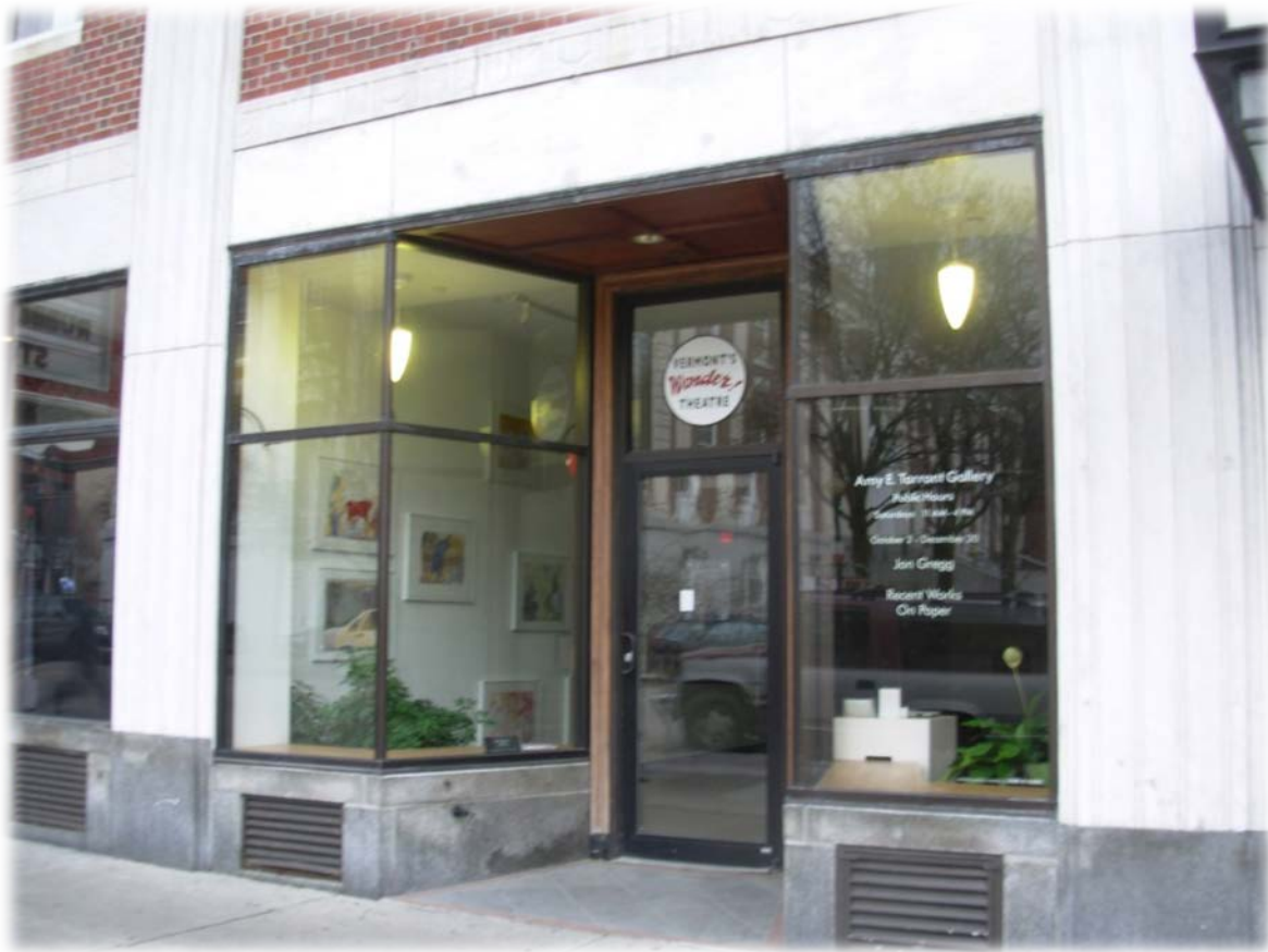
This is the Amy E. Tarrant Gallery from outside

Soon I will be going to visit an art exhibition at the Flynn! Besides the theaters where people see live performances, the Flynn also has an art gallery where artists can show paintings, drawings, and photographs. It is a place where people can come and look at the art.